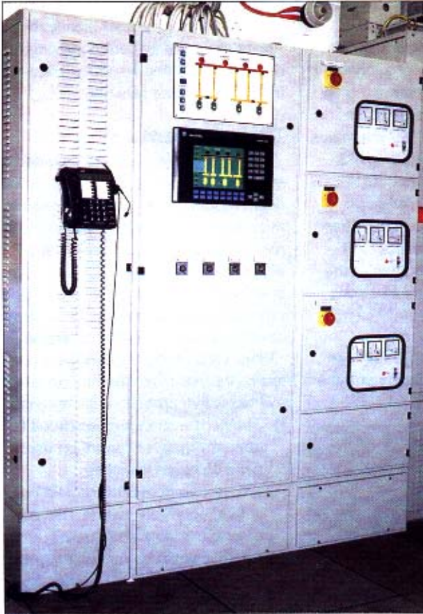
Main Triplex panel at lower level; 3DC supplies on right hand side, battery section on the left.

Triplex Power Control (TPC) is a company whose sole activity is to design and install high reliability systems to control alternative building supplies, which still operate correctly even if one of the above faults should occur. This is achieved by the use of triplicated circuitry that produces a "two-out-of-three" priority system, such that any one fault on a power supply, any component, or one part of the wiring, has no effect at all on the correct operation of the circuit. This fundamental approach has been used on aircraft since the mid sixties, but is